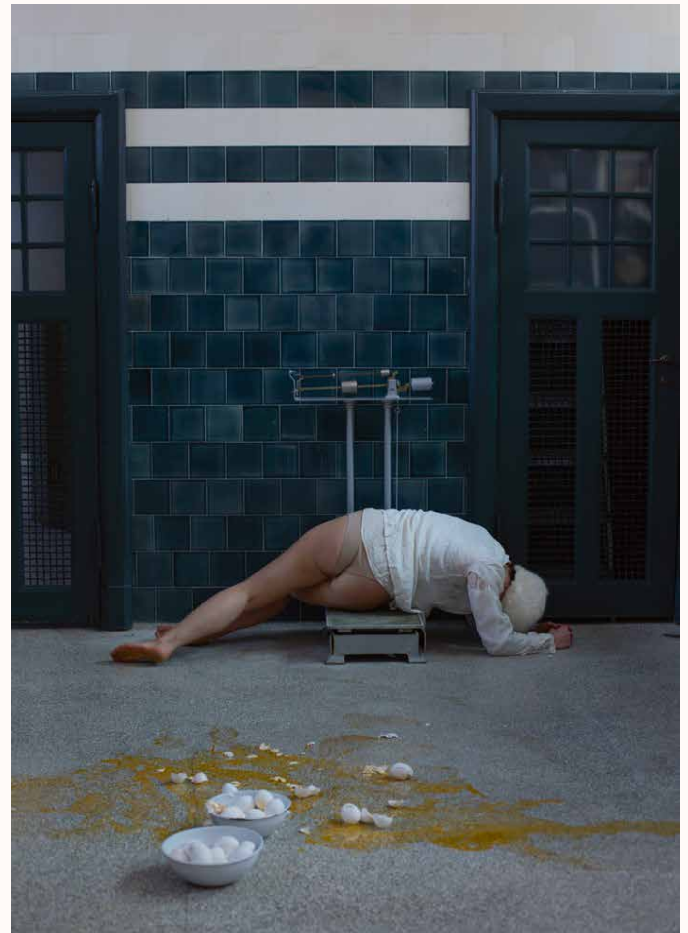
GIVING BIRTH: The Sister cleansing singular. Grand shifting. Climbing mountains. Giving birth. Sisters Academy #3 is now on in Sweden. (For more info http://sistersacademy.dk/about/inkonst/ )

www.sistershope.dk www.sistersacademy.dk