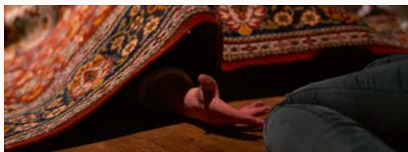
SISTERS ACADEMY #1 – Documentation